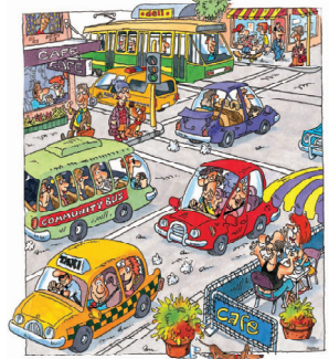
Australian educational pamphlet