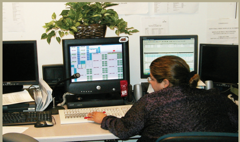
Capitol Metro (Austin, TX) dispatcher managing an ADA demand response system